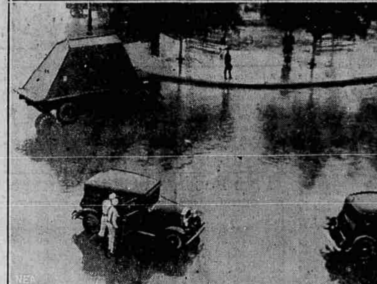
The recent "hotel battle" between the Cuban soldiers and their officers in Havana, in which about 100 were killed and 200 wounded, was only a passing event in what has been a constant bloody struggle against Communist uprisings. In this picture Cuban sailors are shown searching passing automobiles for weapons at a spot where six were killed and 27 wounded in attack riot. Note the armored truck at upper left.