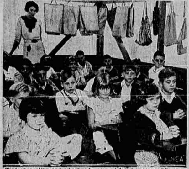
Tents, bungalows and schoolyards are used for classrooms while several Los Angeles schools are empty. This follows their classification as unsafe in examination after the southern California earthquake last March.