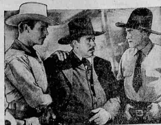
MAN OF THE FOREST

Randolph Scott, Harry Carey, Noah Beery, Verna Hillie and Buster Crabbe play the leading roles in Zane Grey's "Man of the Forest" at the Liberty theatre Friday and Saturday. Henry Hathaway, who has directed the past six picturizations of Grey's novels, also wielded the megaphone on this production.