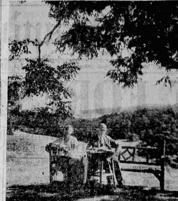
President Roosevelt, seated with Mrs. Roosevelt, relaxes and "takes it easy" in the shade of one of the trees on his spacious grounds at Hyde Park, N. Y., where he spends his time when not at the White House.