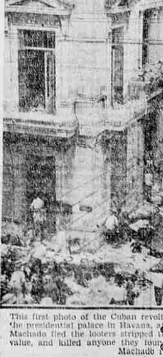
This first photo of the Cuban revolution shows wreckage strewn around the presidential palace in Havana, after being sacked by a mob. After Machado fled the looters stripped the palace floors of everything of value, and killed anyone they found who was connected with the regime.