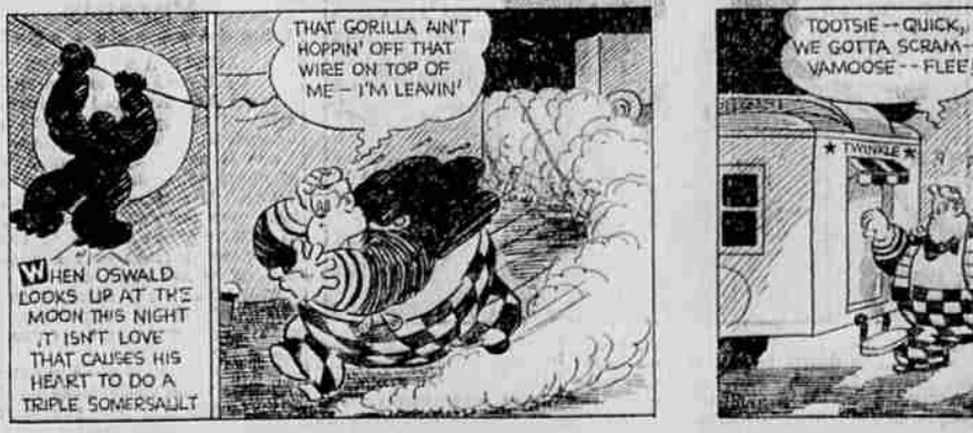
U.S. PAT. OFF. 8-14