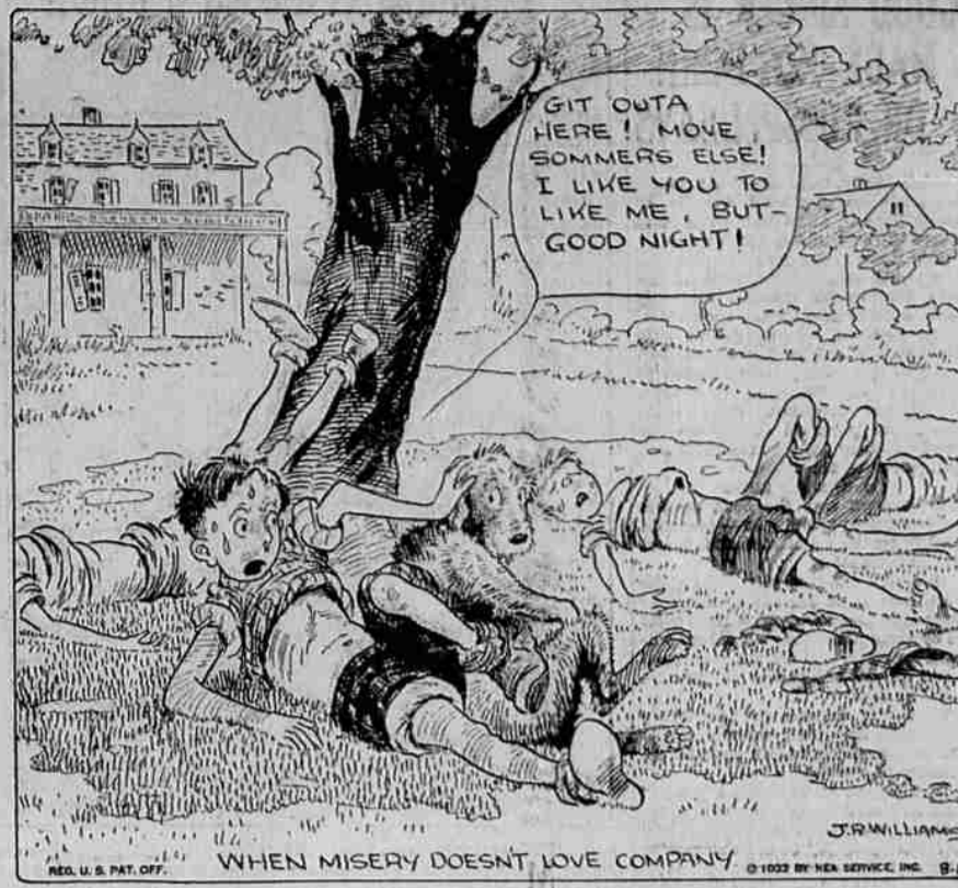
WHEN MISERY DOESN'T LOVE COMPANY © 1933 BY NEA SERVICE, INC. 8-14