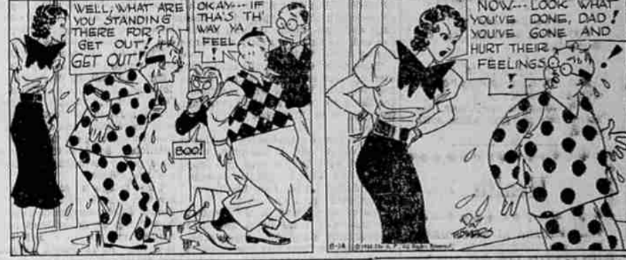
A Hand Grenade