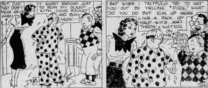
U.S. PAT. OFF. 8-14