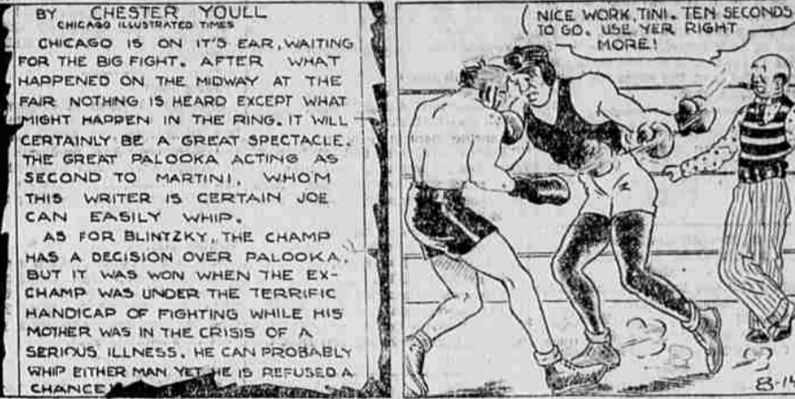
U.S. PAT. OFF. 8-14