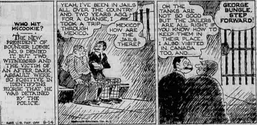
U.S. PAT. OFF. 8-14