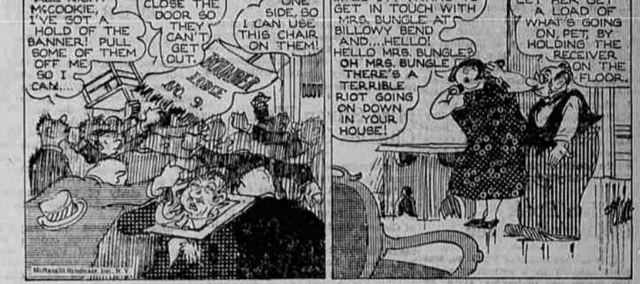
REG. U. S. PAT. OFF. © 1933 BY NEA SERVICE, INC. The Nightincroak