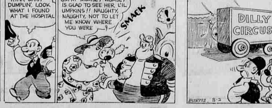
(Trademark Registered) U. S. Patent Office