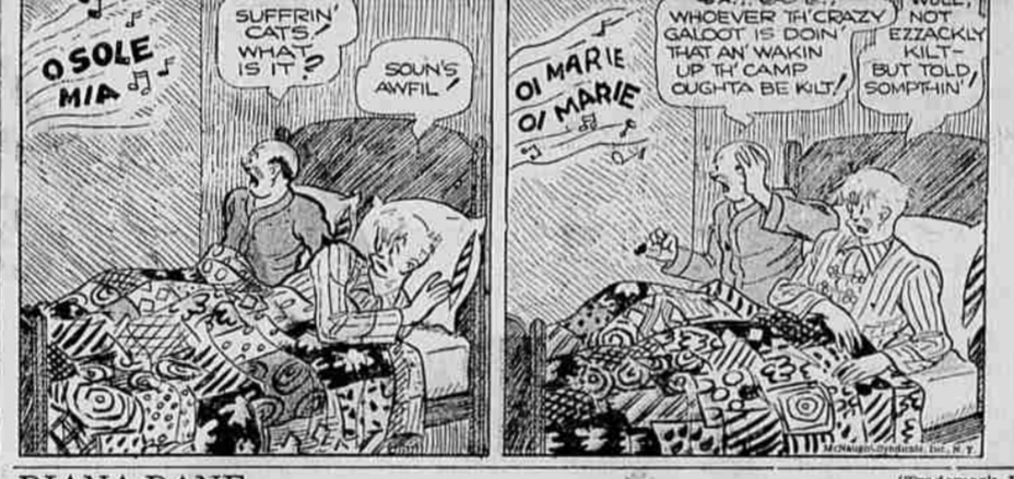
(Trademark Registered) U. S. Patent Office