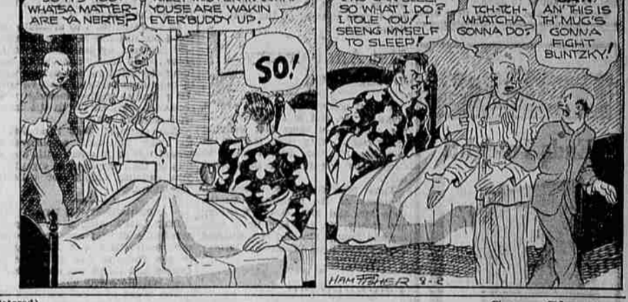
(Trademark Registered) U. S. Patent Office