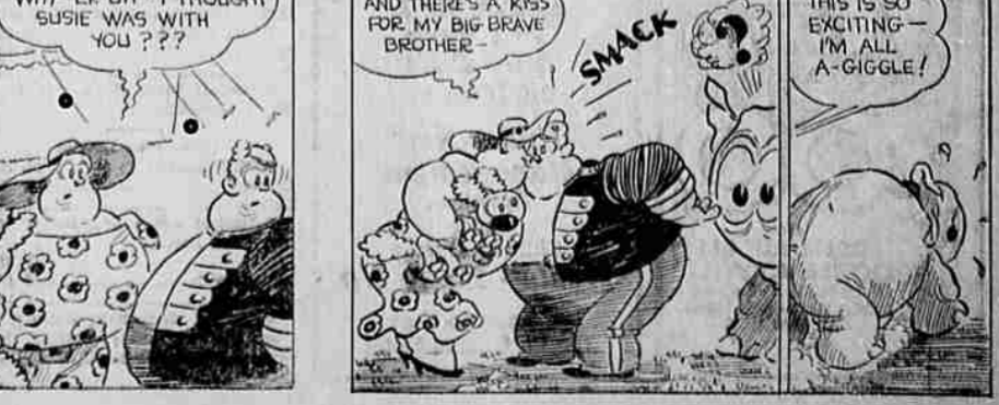
(Trademark Registered) U. S. Patent Office