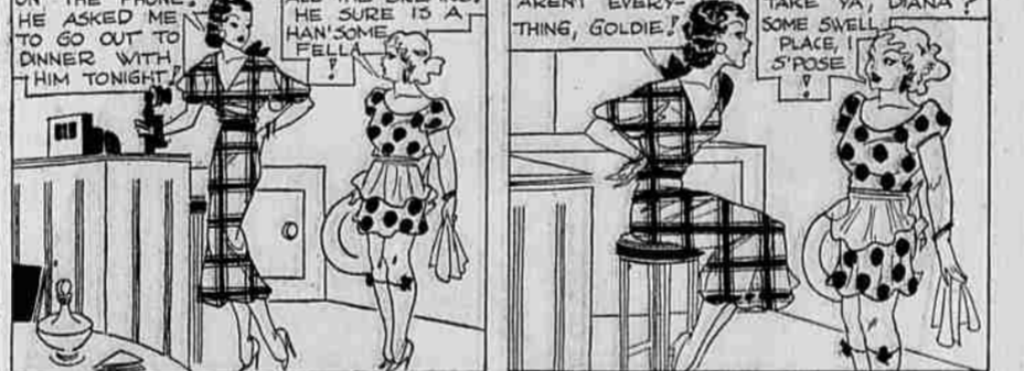
(Trademark Registered) U. S. Patent Office