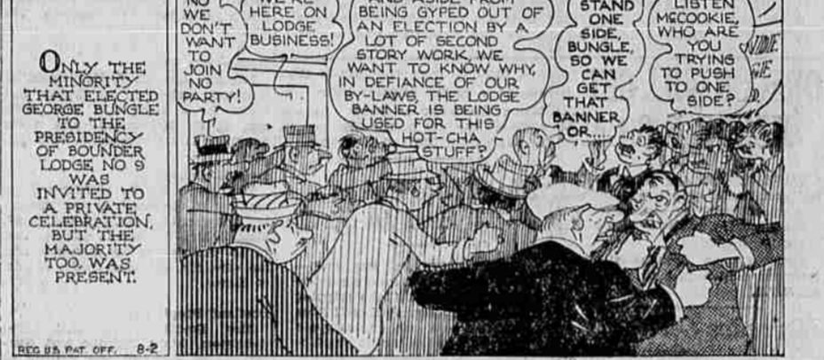
REG. U. S. PAT. OFF. © 2 THE BUNGLE FAMILY