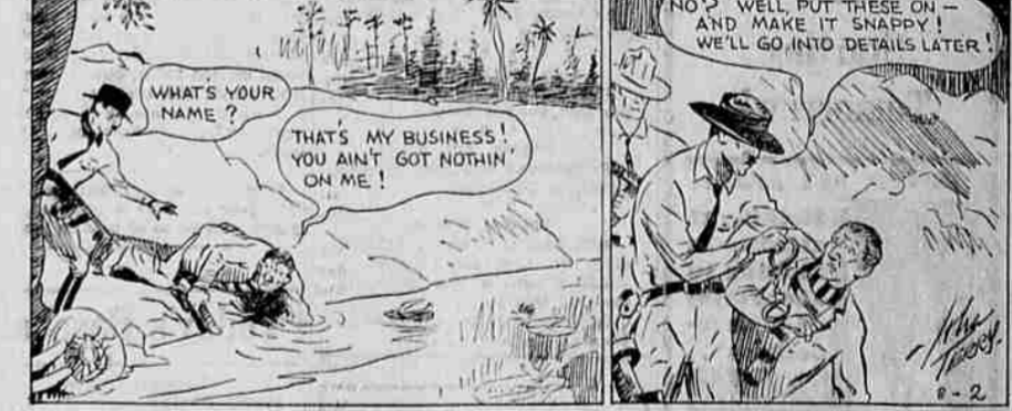
(Trademark Registered) U. S. Patent Office