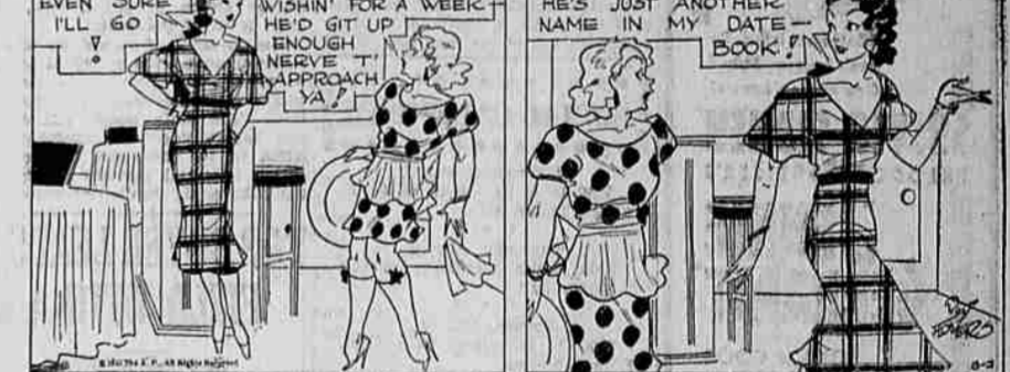
(Trademark Registered) U. S. Patent Office