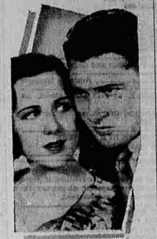
SONG OF THE EAGLE

All the tremendously exciting events you have lived through in the last twenty years are vividly pictured on the screen in a sweeping panorama of American life entitled "Song of the Eagle," Paramount's thundering epic of the American scene, which opened today at the Liberty theatre. A superb cast including such excellent players as Charles Hickford, Richard Arlen, Mary Brian, Jean Harlow, Louise Dresser, Andy Devine and George E. Stone, are featured under the direction of Ralph Murphy.