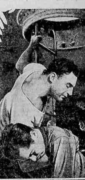
ROBERT MONTGOMERY in a scene from "HELL BELOW"