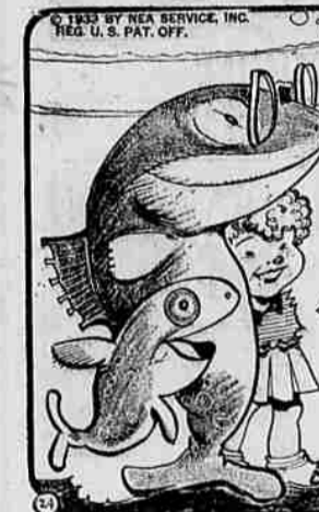
(READ THE STORY, THEN COLOR THE PICTURE)

"Now that the pretty singing's over," said Scouty, "kindly tell us more about your little schoolroom. What are all these fine fish taught?" "Do they all come here every day, and do they have some time for play? What happens if, upon a hook one of the fish is caught?" "My goodness, you ask questions, lad," the teacher said. "But I'll be glad to tell you everything I know about the life down here." "If little fish do as they're told and don't swim round and act too bold, there really isn't anything at all that they need fear." "THEY'RE taught to eat nice seaweed. That's really all they ever need, but sometimes they forget themselves and grab a hook that's dropped." "They realize, too late, their plight, and then they're pulled up out of sight. The fishermen take lots of fish. I wish it could be stopped." "Now, as to play—well, goodness me, you'd be surprised if you could see the little games of tag