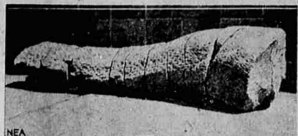
A rack mass, peculiarly pitted on the outside, and fitting together perfectly to form the tail of a gigantic lizard, has started a hunt for further traces of possible saurian fossils near Eureka, Nev. Photo shows the sections fitted together.