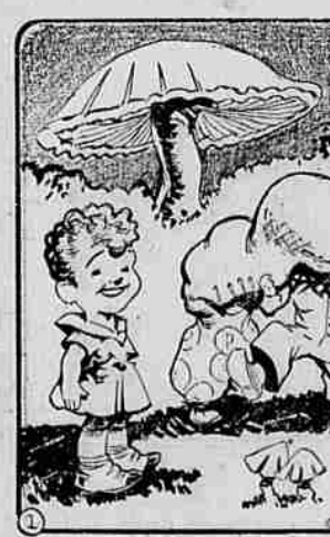
(READ THE STORY, THEN COLOR THE PICTURE)

THE Tinymites soon grew tired of being bounced and tossed about by all the little serpent men. Said Duncy, "That was fun!" "Now, let us toss you for a while." "All right," yelled one man, with a smile. "I guess we will be safe because we've shown you how it's done." The little man crawled right into the net and yelled: "It's up to you! See how high you can toss me. This will be a dandy treat!" "Be sure and catch me safe and sound. While I'm in the air I'll whirl around. It might give me an appetite. Then we'll find food to eat." "Oh, gee! That sure sounds good to me. I am as hungry as a can be," said Duncy. "Don't you worry! You'll be tossed up good and high!" "Just yell when you have had enough. We do not want to treat you rough. Be careful you don't bump into a cloud in the sky." It wasn't very long until all