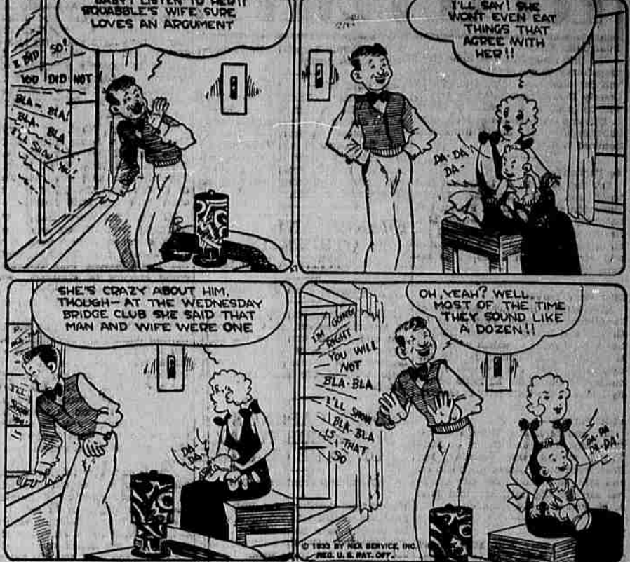
© 1933 BY NEA SERVICE, INC. REG. U. S. PAT. OFF.