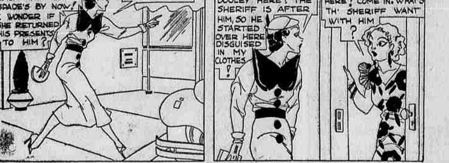
(Trademark Registered) U. S. Patent Office