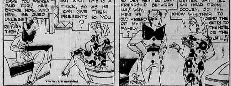
© 1933 BY NEA SERVICE, INC. REG. U. S. PAT. OFF.