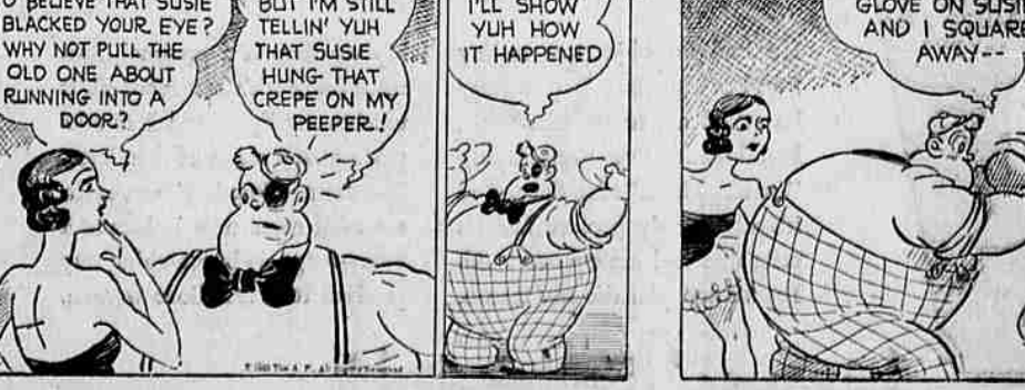
(Trademark Registered) U. S. Patent Office