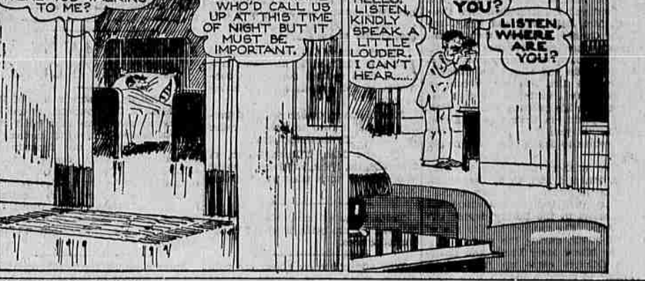
© 1933 BY NEA SERVICE, INC. REG. U. S. PAT. OFF.