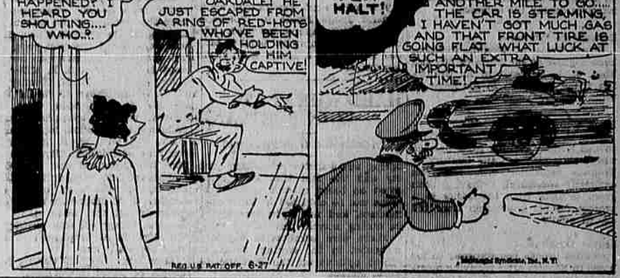
© 1933 BY NEA SERVICE, INC. REG. U. S. PAT. OFF.