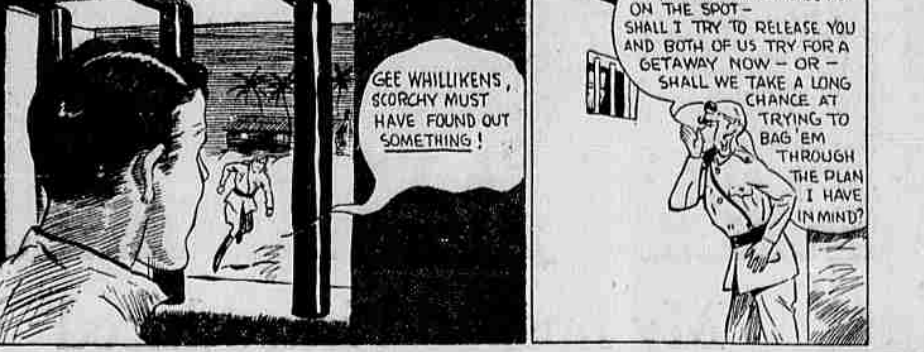
(Trademark Registered) U. S. Patent Office