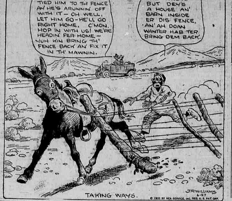
TAKING WAYS. © 1933 BY NEA SERVICE, INC. REG. U. S. PAT. OFF.