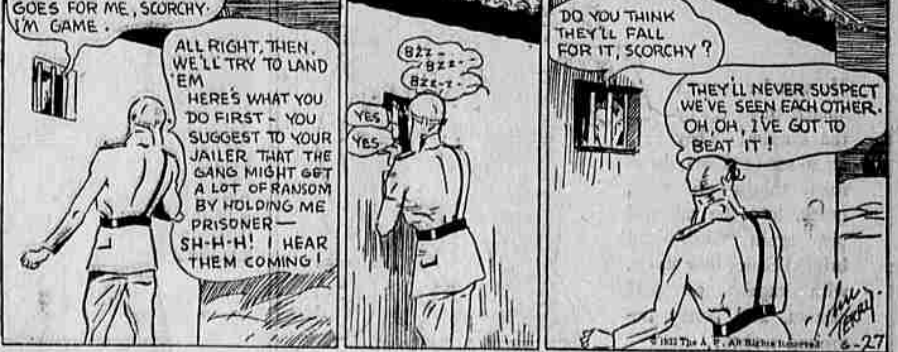
© 1933 BY NEA SERVICE, INC. REG. U. S. PAT. OFF.