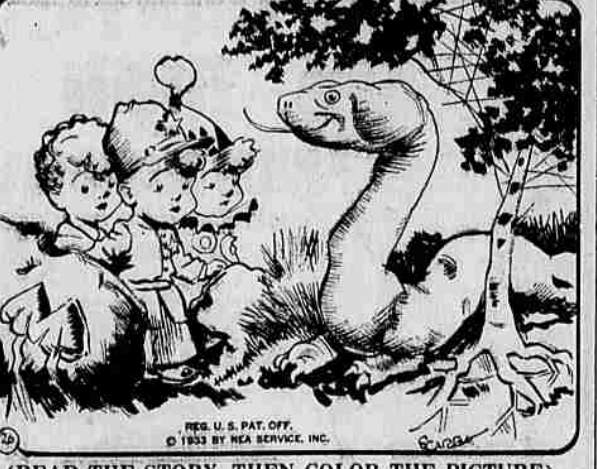
(READ THE STORY, THEN COLOR THE PICTURE)