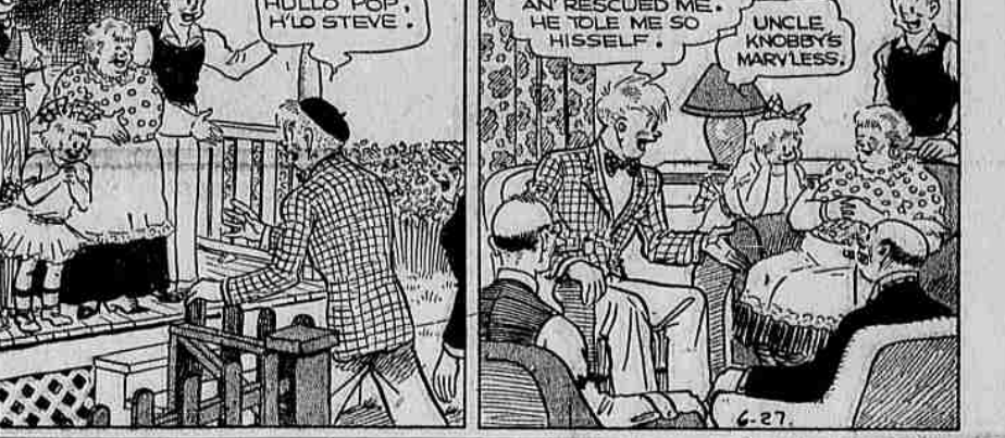
© 1933 BY NEA SERVICE, INC. REG. U. S. PAT. OFF.