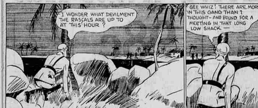
© 1933 BY NEA SERVICE, INC. REG. U. S. PAT. OFF. 6-23