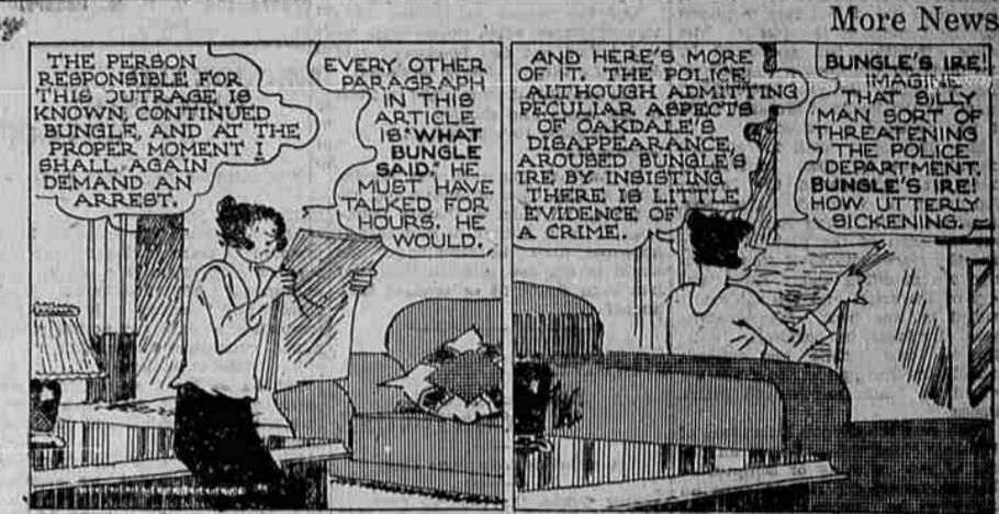
© 1933 BY NEA SERVICE, INC. REG. U. S. PAT. OFF. 6-23