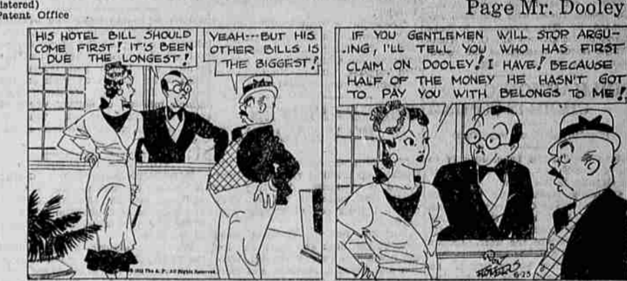
© 1933 BY NEA SERVICE, INC. REG. U. S. PAT. OFF. 6-23