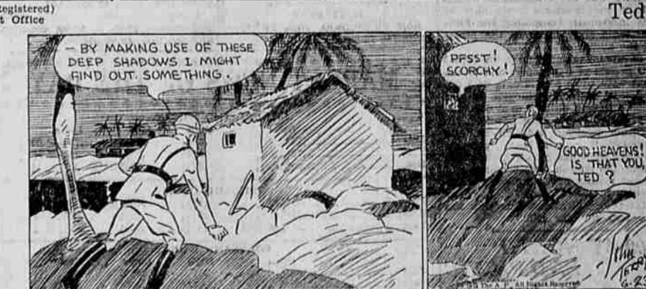
© 1933 BY NEA SERVICE, INC. REG. U. S. PAT. OFF. 6-23