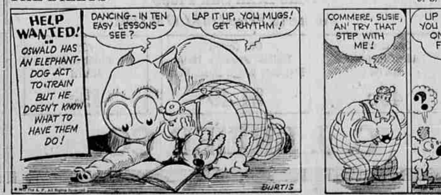
© 1933 BY NEA SERVICE, INC. REG. U. S. PAT. OFF. 6-23