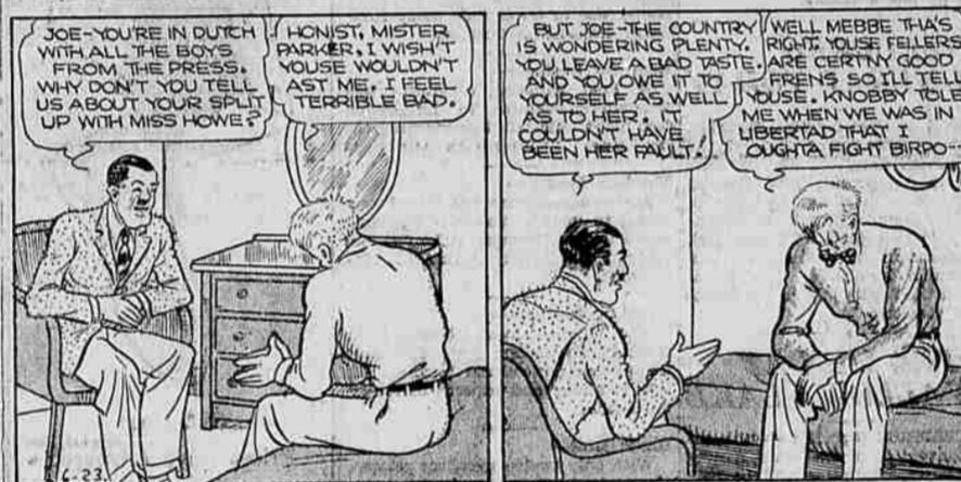
© 1933 BY NEA SERVICE, INC. REG. U. S. PAT. OFF. 6-23