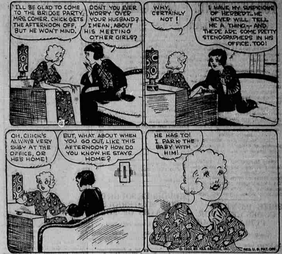
© 1933 BY NEA SERVICE, INC. REG. U. S. PAT. OFF. 6-23