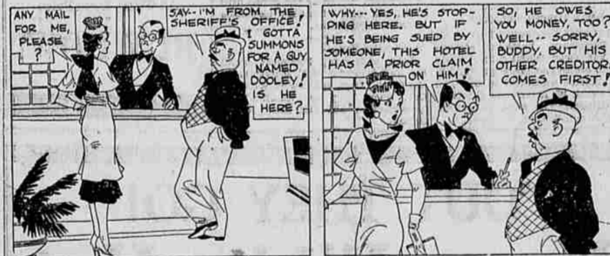
© 1933 BY NEA SERVICE, INC. REG. U. S. PAT. OFF. 6-23