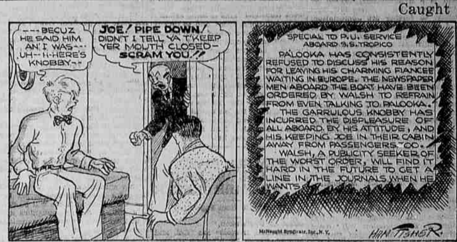
© 1933 BY NEA SERVICE, INC. REG. U. S. PAT. OFF. 6-23