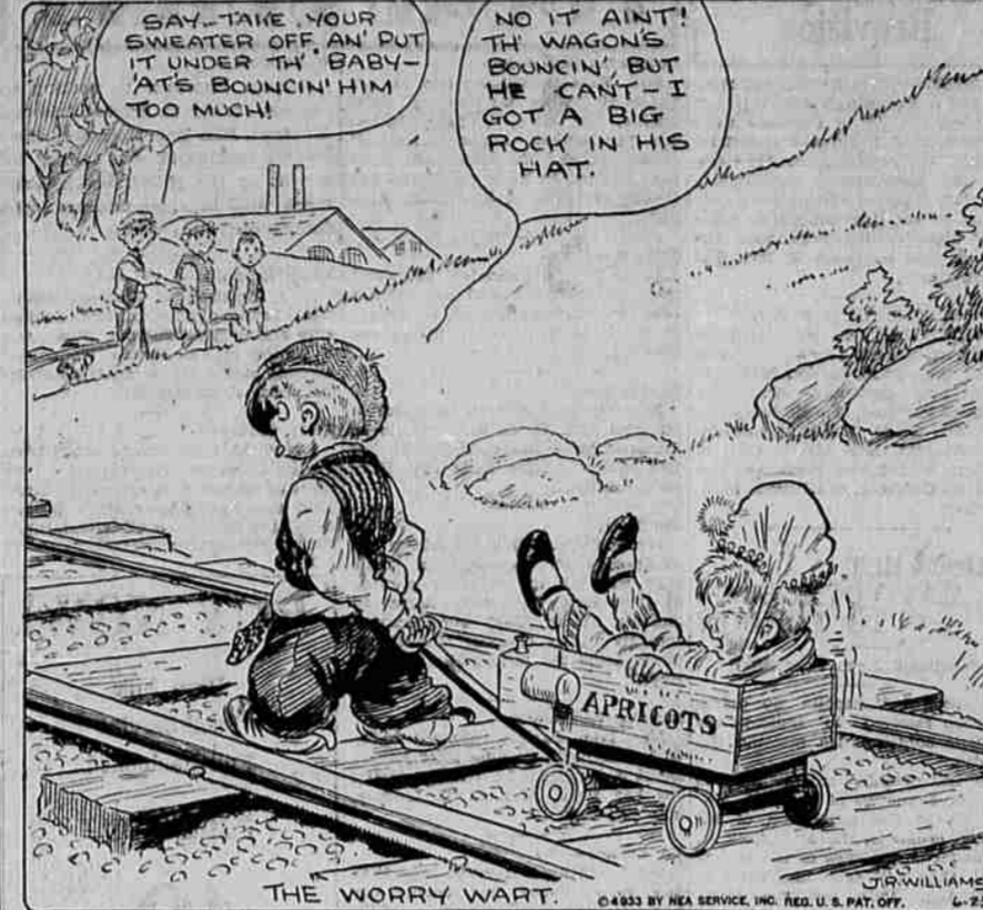
THE WORRY WART. REG. U. S. PAT. OFF. 6-23