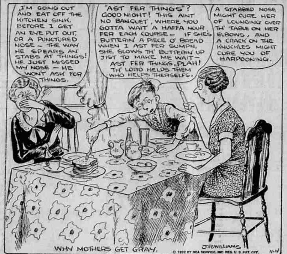
WHY MOTHERS GET GRAY.