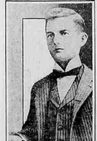
FOR VICE PRESIDENT: The Democratic nominee. AGE: About 30. (When this picture was taken about 1890). EXPERIENCE TO DATE: A Texas farm lad who, while working as a cowboy, has been studying law in his spare time so successfully that he is due to be admitted to the bar at 21. NAME: John Nance Garner.