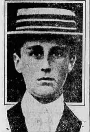
FOR PRESIDENT: The Democratic nominee. AGE: 16 years. (When this picture was taken in 1884). EXPERIENCE TO DATE: Son of vice president of Delaware and Hudson Railroad, educated as child by private tutors, now attending Groton, where he managed school baseball team. NAME: Franklin Delano Roosevelt.