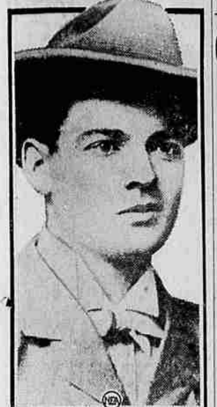
FOR PRESIDENT: The Republican nominee. AGE: 24 years. (When this picture was taken in 1898). EXPERIENCE TO DATE: A former Iowa farm boy, graduate of Stanford University, now an enterprising young mining engineer—and still unmarried. NAME: Herbert Clark Hoover.