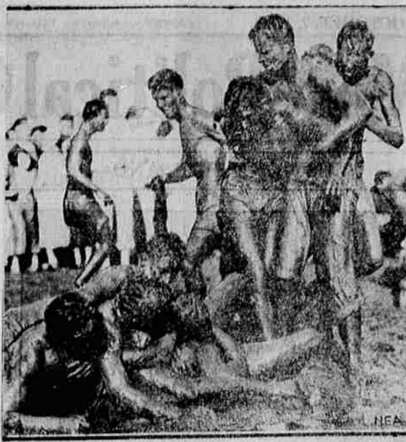
No, la-dees and gentlemen! This is not a picture of a stately group in marble. It's merely some of the boys whooping up things at the Los Angeles Junior college where the first and second semesters miss each other up in the mud.