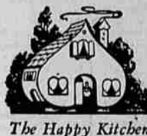
The Happy Kitchen

... which is an event of interest and importance to every woman of this city. Remember the dates and reserve all four afternoons for the Kitchen Chautauqua. . . New, Diverting, Instructive.