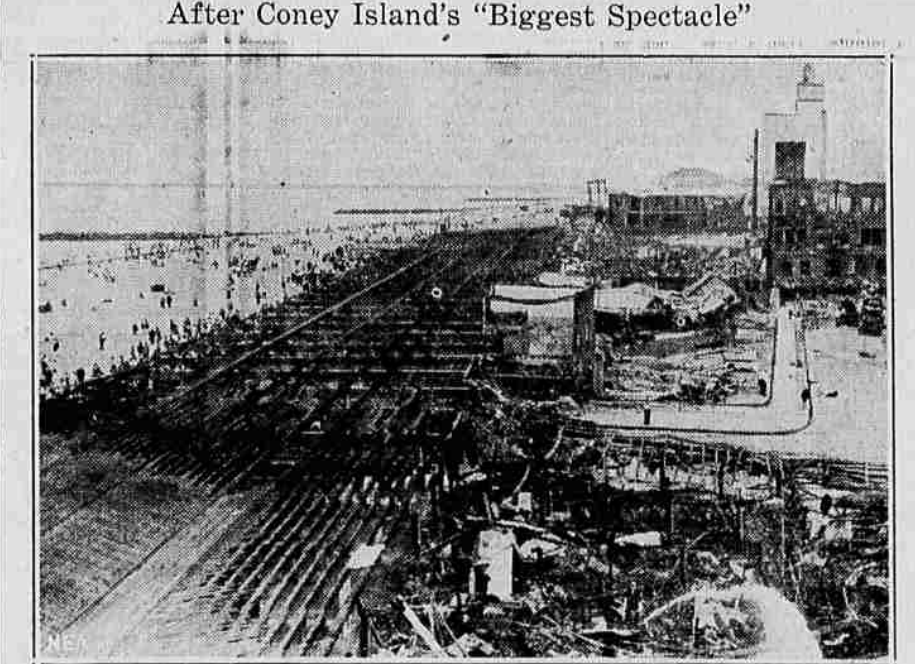
After Coney Island's "Biggest Spectacle" The fire-blackened framework of Coney Island's famous boardwalk and the charred ruins of adjacent buildings are shown in this graphic photo taken after wind-driven flames had lapped up water-front property valued at $5,000,000.

Dancing - - Singing - - Comedy Matinee 30c Evenings 40c Kiddies 10c