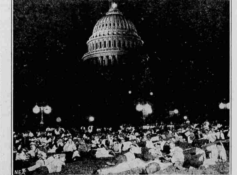
Swirling on the grass while bright lights beat down upon them from the capitol, hundreds of bonus marchers—most of them members of the California delegation—conducted this impressive "all-night siege" before the nation's legislative building. Defying police orders against camping on the capitol grounds, the veterans chose this means of bringing more forcibly to the attention of congress their demands for immediate payment of the bonus.