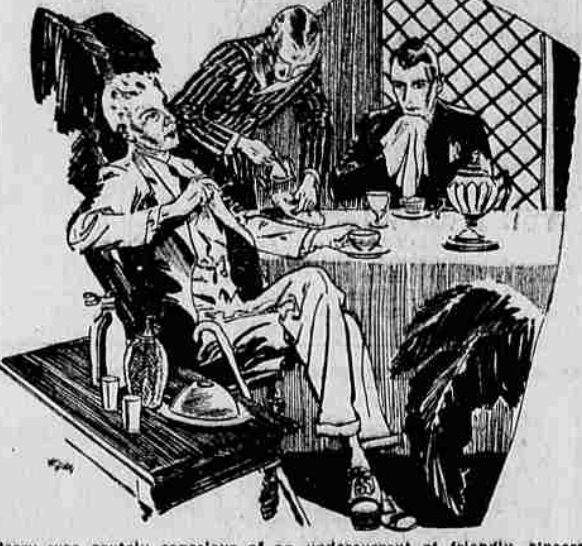
Jerry was acutely conscious of an undercurrent of friendly, sincere warning.

each of my guests. The cost of entertaining them is high. I may collect one, even two more such bills before I can bring myself to allow this delightful little group to depart.