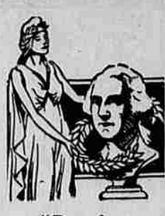
"Buy for Two Days"