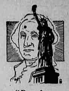
"Buy for Two Days"

your foods for that two-day outing. You have looked forward to this day with anticipation and we see no need of depriving yourself of a lot of good things to eat, when you can get them at the lowest possible cost. Make this a Save and Sane Fourth by Food Shopping the Safe-way.