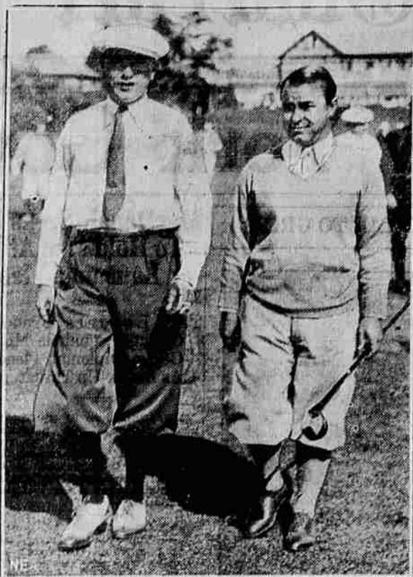
Outstanding rivals for supremacy in the National Open Golf tournament, Gene Sarazen (right) and Billy Burke (left) are pictured here as they marched together over the Fresh Meadow Country club course on Long Island. Burke was the defending champion, and Sarazen, winner of the British Open, was out to duplicate Bobby Jones' performance of winning both major open meets of the year of which fete he has successful.