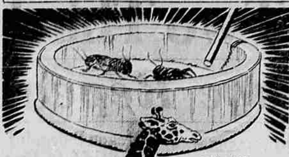
A GIRAFFE'S FRONT LEGS ARE NO LONGER THAN ITS HIND ONES.