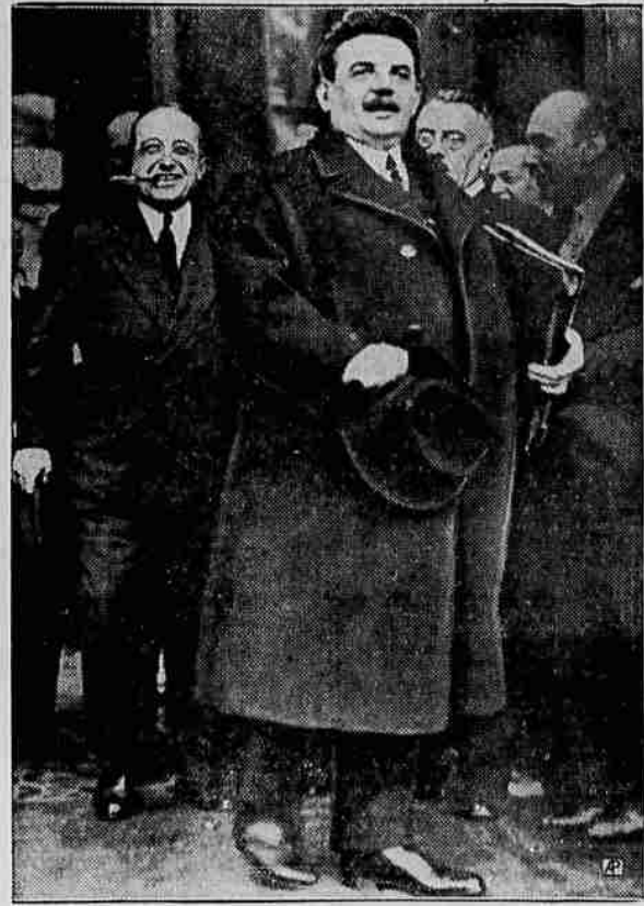
Andre Tardieu, just retired as premier of France, seems more gladdened than downcast as he emerges from a conference in the wake of Edouard Herriot, victor in recent elections. The bulging brief case under Herriot's arm probably explains Tardieu's look of relief.