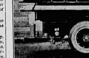
This is the larger of the two trucks in the service of the local fire department. It is a 6-cylinder Stutz truck with a 225-horsepower motor.