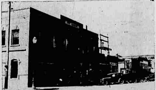
This building, located at the corner of Washington avenue and Elm street, houses the city fire department, water office, police station, treasurer's office, city manager's office, the municipal court, a small auditorium, and the city engineer's office.