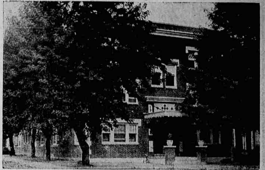
This is one of La Grande's newer apartment buildings, located at the corner of Washington avenue and Third street, in a beautiful residential section. The fine three-story brick structure contains 24 apartments completely furnished.