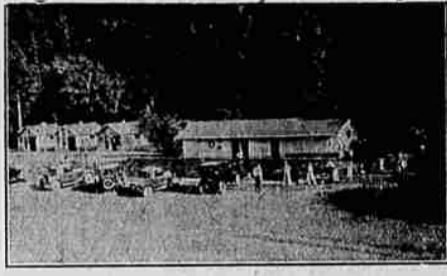
This modern auto camp, located on the Old Oregon Trail just two miles west of La Grande, attracts many tourists as well as local people by its fine swimming pool. The Grande Ronde river flows along the edge of the camp, which is equipped with neat, well-built cabins and a public kitchen.

In tulip beds, the raiding of a few this spring resulted in the posting of a reward for the apprehension of anyone stealing flowers or mutilating flower beds. And the big bird dog, with his carefree, destructive stride, is getting "in bad" more and more.