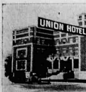
This modern hotel is indeed a credit to the town of Union, 33 miles southeast of La Grande on the Old Oregon Trail. Its spacious lawn and its large front porch make an attractive exterior, and the rooms are comfortable and well furnished.