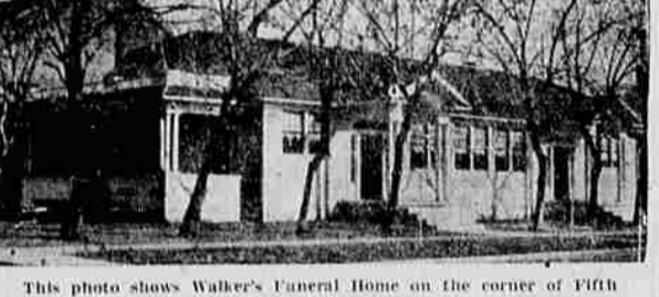
This photo shows Walker's Funeral Home on the corner of Fifth street and Spring avenue.