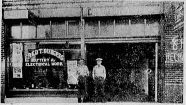
This modern shop, located on Jefferson avenue between Elm and Fir streets, is equipped for all kinds of battery and electrical service and repair work.