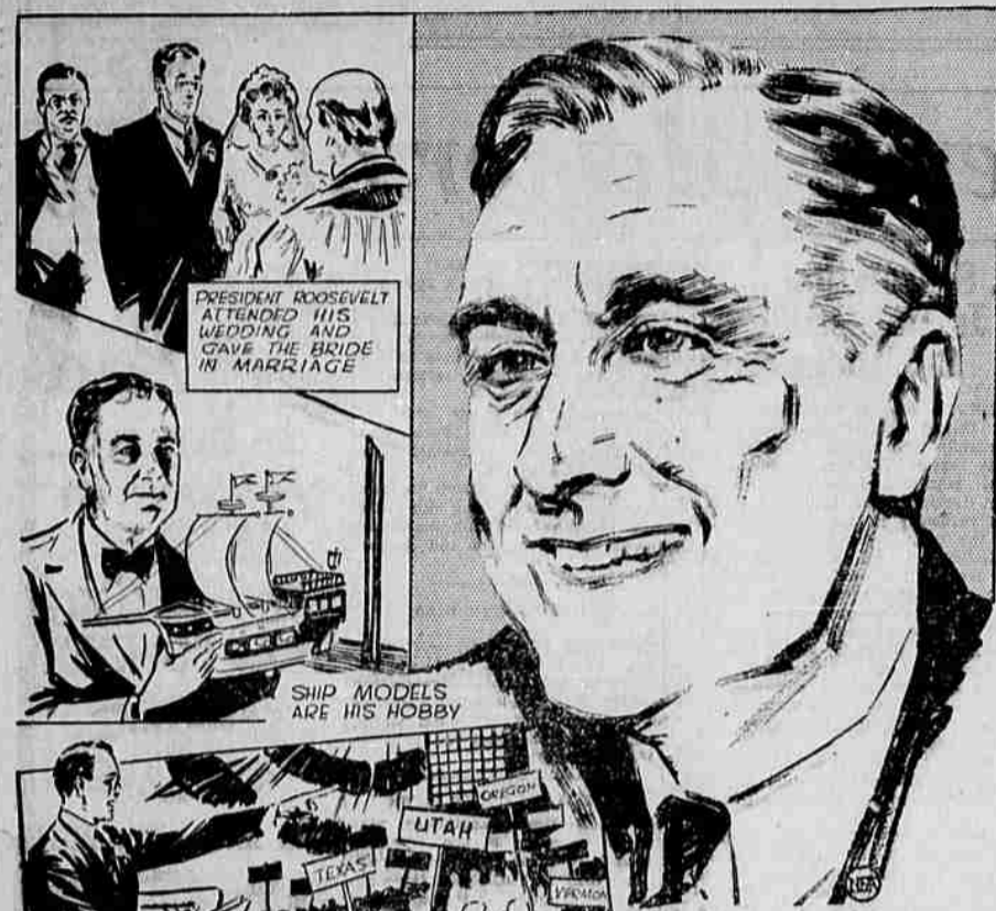
PRESIDENT ROOSEVELT ATTENDED HIS WEDDING AND GAVE THE BRIDE IN MARRIAGE