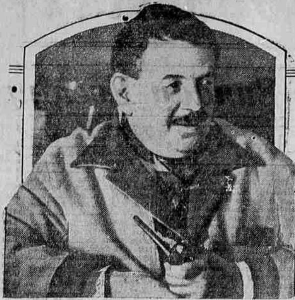
Edouard Herriot, premier expectant of France, in early morning attire smilingly received congratulations on his party's victory at the polls. But he faces a complicated situation.

Linked with this big question, is the situation at the disarmament conference in Geneva. There has developed an almost united front against the French proposal for an international army. There is also on the Italian demand for naval parity. The parliament may be called upon to fit this opposition into the time-honored French thesis of "security before disarmament." France is also combating a German-Austrian-Hungarian-Italian-Turkish coalition which is driving for a revision of the treaty of Versailles. But in opposing this she has the aid of her war-born allies, Poland, Czechoslovakia, Jugoslavia and expanded Rumania. U. S. Trade Dispute Finally there are questions of trade relations with the United States, Canada, Argentina and several European countries arising out of the quota import system originated by the Laval government last fall. Foreign business interests complain that the quotas are ruining their