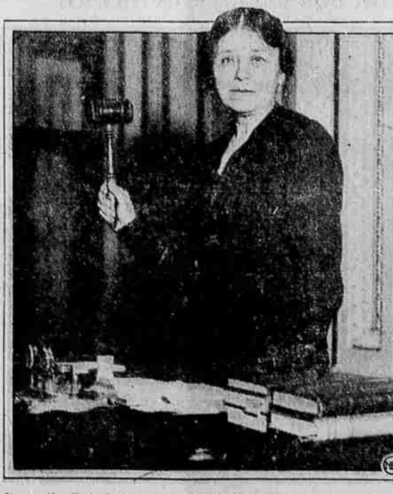
It was the first time a woman ever had presided over the U. S. Senate when, in the history-making moment pictured above, Mrs. Hattie Caraway—the Democratic Senator from Arkansas—took gavel in hand in the upper house. She occupied the presiding officer's desk briefly at the invitation of Vice President Curtis.