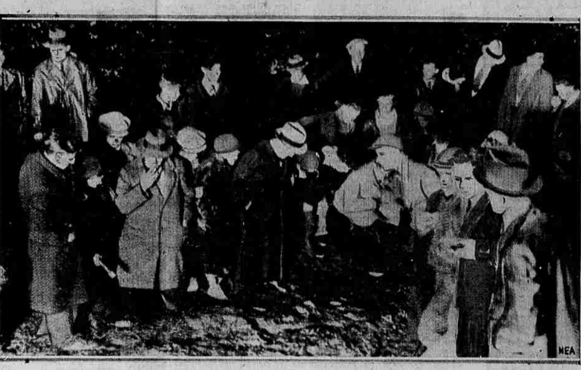
Above — Scene of gruesome find near Lindbergh's home. The spot where the baby's body was found near Mount Rose, N. J., four and a half miles from the Lindbergh estate. Below — This map of the vicinity of Hopewell, N. J., shows where the baby's body, with skull crushed, was found in the neighborhood of Lindbergh's estate, from which the child was kidnaped March 1. Both pictures were transmitted by telephoto from New York City to San Francisco, thence to Oregon by airplane.

WHERE THE LINDBERGH BABY WAS FOUND THURSDAY AFTERNOON