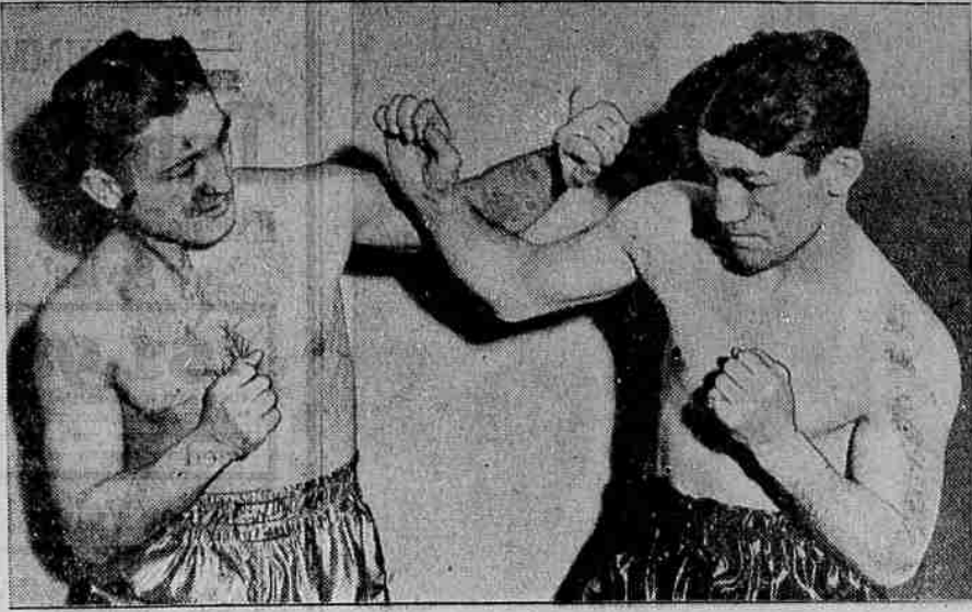
Above is the way Billy Petrolle and Bat Battalino stack up. The pair meet in a 10-round bout in Chicago May 20. Petrolle stopped the former feather champ in 13 rounds in the first bout.

By Loren Disney (Associated Press Sports Writer) NEW YORK (AP)—They probably gave Bat Battalino the butcher knife to play with when he was a baby.