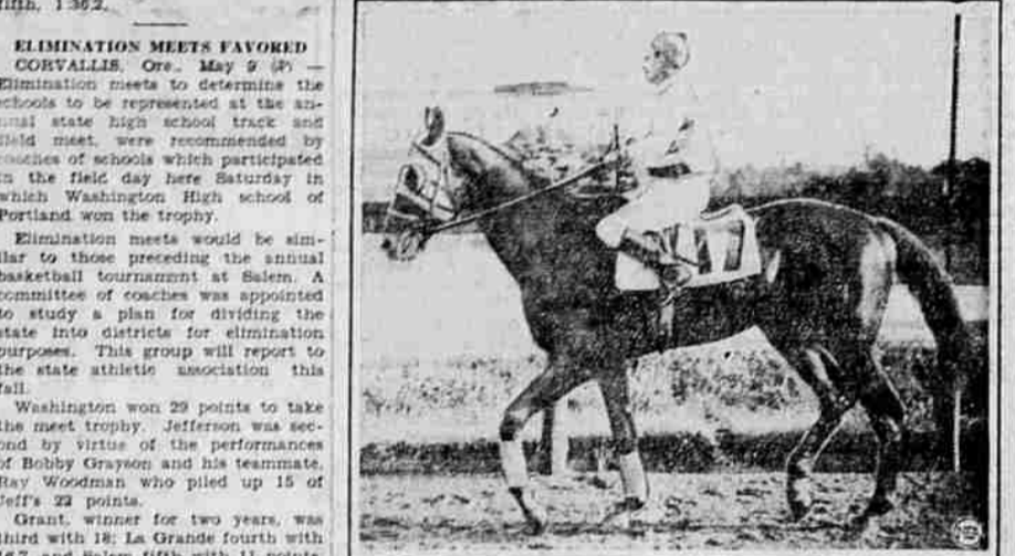
Here is Burgoo King, the horse that romped home at Churchill Downs Saturday to win the Kentucky Derby, beating such rivals as Economic, Stepenfeterbil and Tick On.