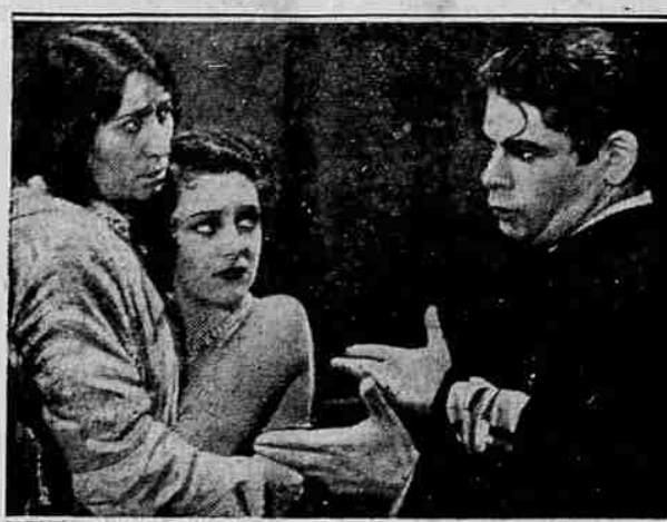
Paul Muni in a scene from Howard Hughes' "Scarface"