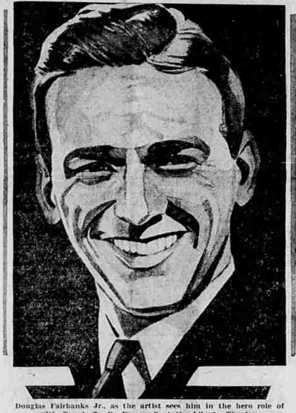
Douglas Fairbanks Jr., as the artist sees him in the hero role of "It's Tough to Be Famous," at the Liberty Theatre.