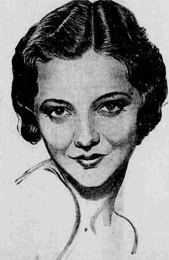
Pencil sketch of Sylvia Sidney, coming to the Liberty Sunday and Monday in "The Miracle Man."

LAUGHS IN THE JURY BOX Intricacies of jury duty are being explained to Edna May Oliver by Ken Murray, art Roscoe Ates, Kate Price and Guinn Williams look on. The scene is from "Ladies of the Jury," opening today at the Liberty Theatre.