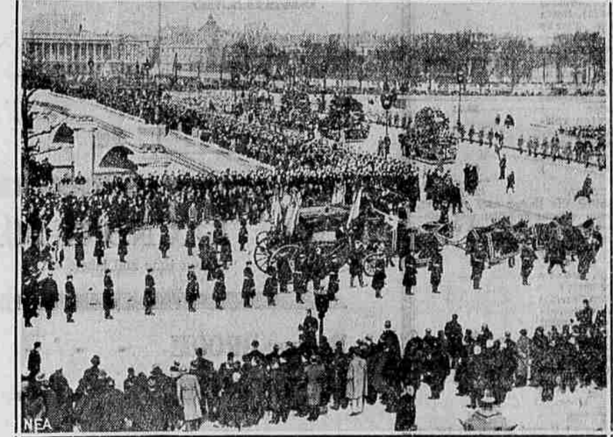
France's grief-stricken thousands solemnly stood by with bared heads as "the great man of peace"—Aristide Briand—was borne amidst military pomp through Paris streets to the little cemetery at Passy. This striking picture reveals the stirring scene as the horse-drawn carriage carrying the famous statesman's casket was about to turn onto Pont de la Concorde.