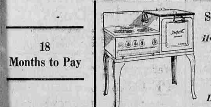
General Electric Hotpoint Automatic Electric Range—"The Modern Maid for Modern Mothers"

SPECIAL OFFER HOTPOINT RANGE $10.00 Down 17 Equal Payments of $6.00 Per Month Last Payment $5.35 18 Months to Pay