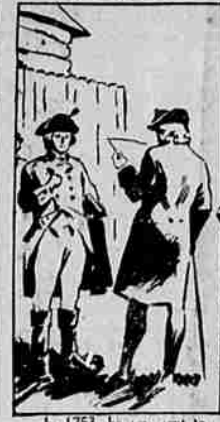
In 1753, he was sent to warn the French to desist from encroachment in the Ohio valley.