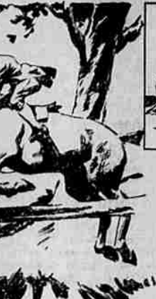
He often played billiards and cards, hunted, fished, and was fond of picnics.