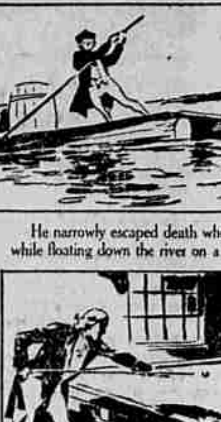
He narrowly escaped death when jerked into the Allegheny while floating down the river on a raft.