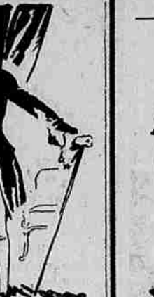
He devoted much time to social life at Mount Vernon.