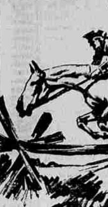
He enjoyed fox hunting and rode to hounds with the gusto of an English squire.