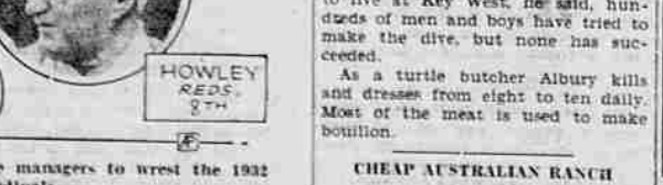
Above is the way