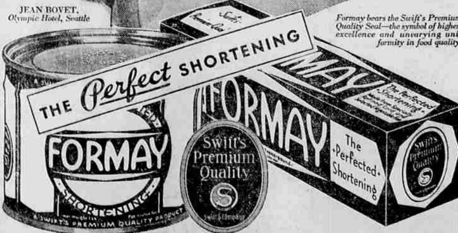
HELEN SWOPE, Edmond Maney Hotel, Seattle

Formay bears the Swift's Premium Quality Seal—the symbol of highest excellence and unvarying uniformity in food quality.