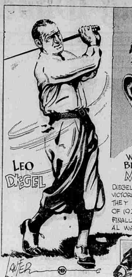
LEO DIEGEL WILD BILL MEHLHORN DIEGEL AND MEHLHORN WON 27 STRAIGHT VICTORIES IN FOUR-BALL MATCHES... THEY WENT UNBEATEN FROM THE FALL OF 1924 INTO JANUARY OF 1927... THEY FINALLY LOST TO TOMMY ARMOUR AND AL WATROUS.