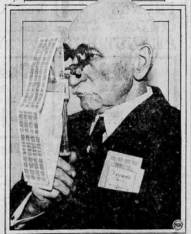
Rear Admiral Bradley Allen Eiske demonstrates the reading machine which he has invented since his retirement from the U. S. navy. He has been able to reproduce a manuscript of 100,000 words on two strips of paper, each a little wider than a newspaper column and about the same length, and he makes the microscopically fine type legible by feeding the strips through this lorgnette-like device.