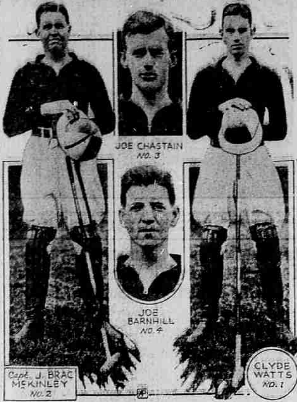
On artillery mounts from an R. O. T. C. unit, pinch-hitting as polo ponies, the quartet shown above will represent the University of Oklahoma in the national intercollegiate tourney, June 13-16, on Long Island. They'll ride against the east's best teams and ponies.

NORMAN, Okla. (AP) — The University of Oklahoma polo team, from the heart of the southwest's horse country, will invade the east with a string of 16 hard-working ponies in quest of the national intercollegiate championship at the Rockaway Hunting club, Cedarhurst, L. I., June 13 to 16.