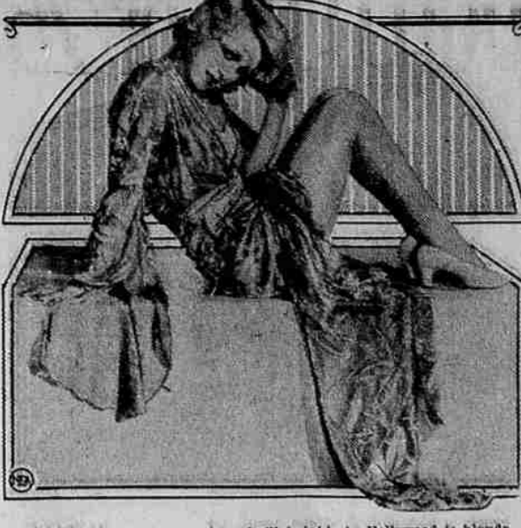
Another little Broadway star who'll twinkle in Hollywood is blonde and winsome Noel Francis, musical comedy favorite. Here you see her in a charming pose. And—don't let this unnerve you—she's going to be cast as a siren in her next picture!