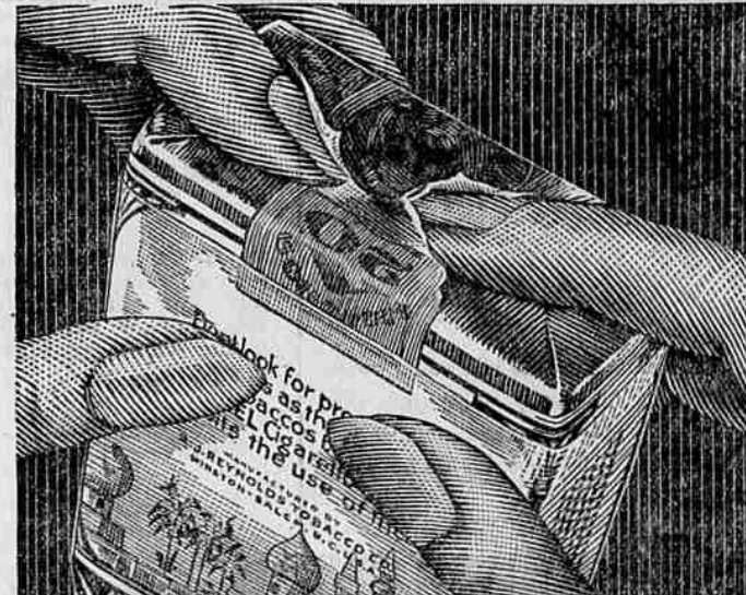
4 To avoid tearing tin foil, slip first finger of each hand under Revenue stamp and break it