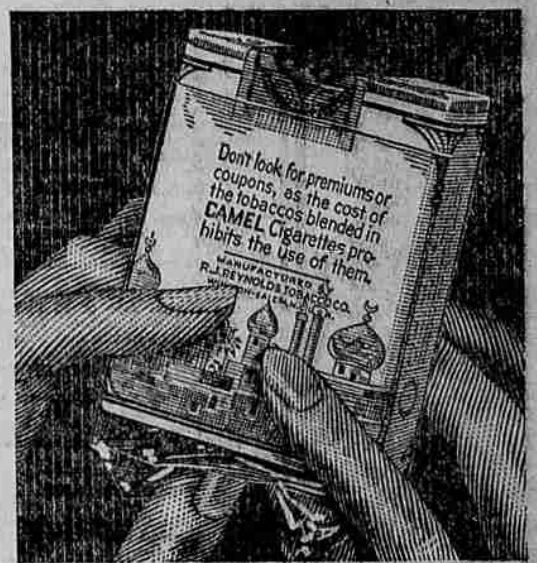
3 Hold package as shown and with your thumbs push it part way out of Humidor Pack