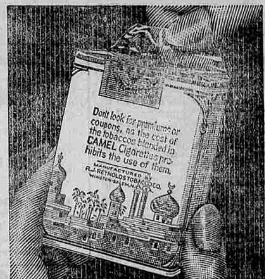
2 Simply lift this flap and you will break the specially devised air-seal