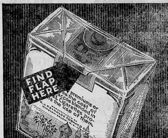
1 Do not tear Cellophane. Look for the convenient flap at the top and back of package