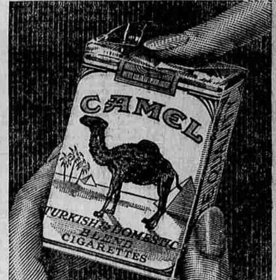
6 Close package. It guards Camels from dust and germs and provides sanitary protection

T HE moment you open the new Camel Humidor Pack you begin to note the advantages of this new, scientific and sanitary method of wrapping Camel cigarettes.