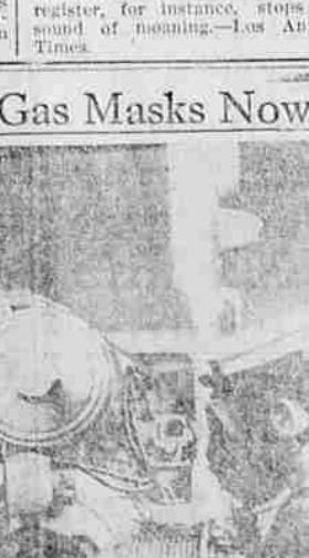
British soldiers long ago made the not altogether enjoyable acquaintance of gas masks, and now the sailors are wearing them as protectors. Here you see a gun crew of H. M. S. Repulse, equipped with gas masks, loading a gun during maneuvers of Gibraltar. All gun crews aboard British battleships must now wear masks as protection against bursting gas shells and gas attacks.