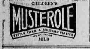
BETTER THAN A MUSTARD PASTER MILD

COMMON head colds often "settle" in throat and chest where they may become dangerous. Don't take a chance—at the first sniffle run for Children's Mustrale once every hour for five hours. Children's Mustrale is just good old Mustrale, you have known so long, in milder form. This famous blend of oil of mustard, camphor, menthol and other ingredients brings relief naturally. Mustrale gets action because it is a scientific "counter-irritant"—not just a salve—it penetrates and stimulates blood circulation, helps to draw out infection and pain. Keep full strength Mustrale on hand, for adults and the milder—Children's Mustrale for little tots. All druggists.