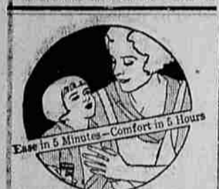
Ease in 5 Minutes—Comfort in 5 Hours