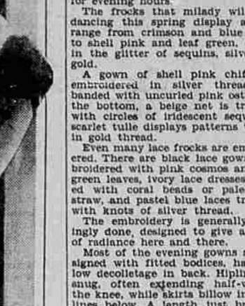
These may be in pastel tints, black or white, all of which promise popularity in the midst of the season's color.

By Diana Merwin (Associated Press Fashion Editor) PARIS (AP)—Sparkle, shimmer and colorful tints mark the new gowns for evening hours. The frocks that milady will wear during this spring display a color range from crimson and blue velvet to shell pink and leaf green, decked in the gutter of sequins, silver and gold.