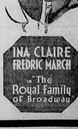
Admired by Millions—Afraid to Love Even One!

The MILK that calls for many an ENCORE THIS MILK STARS IN A DAILY ACT - A FRIEND TO MAN - AND THAT'S A FACT -