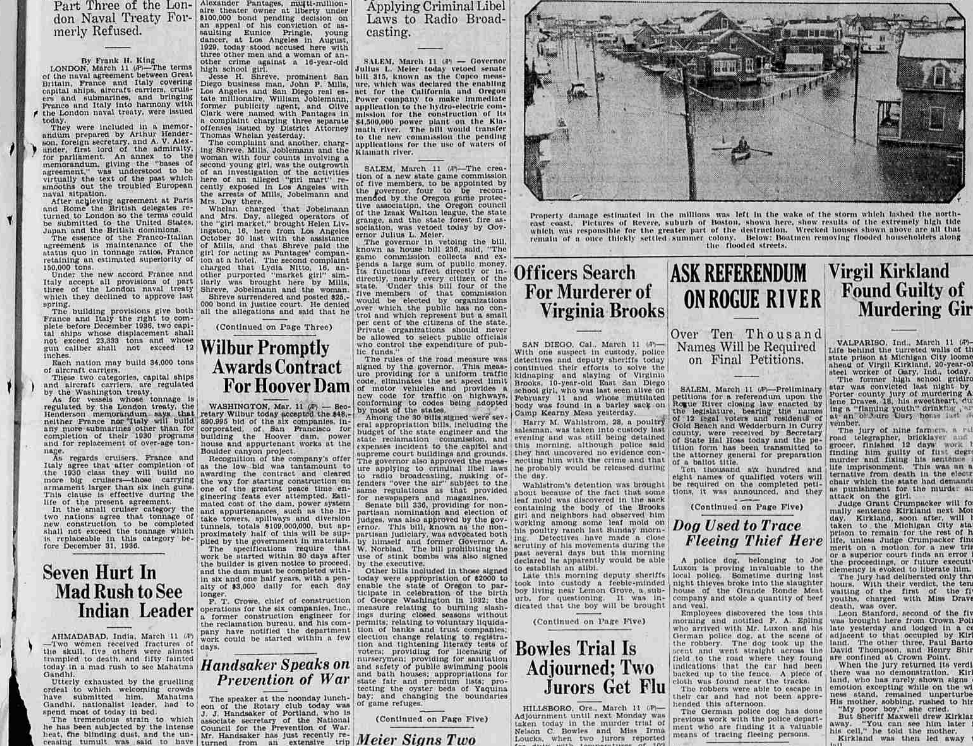
Property damage estimated in the millions was left in the wake of the storm which lashed the north-cast coast. Pictures of Revere, suburb of Boston, shown here, show results of the extremely high tide which was responsible for the greater part of the destruction. Wrecked houses shown above are all that remain of a once thickly settled summer colony. Below: Boatmen removing flooded householders along the flooded streets.

DESTRUCTION LEFT IN WAKE OF ATLANTIC STORM